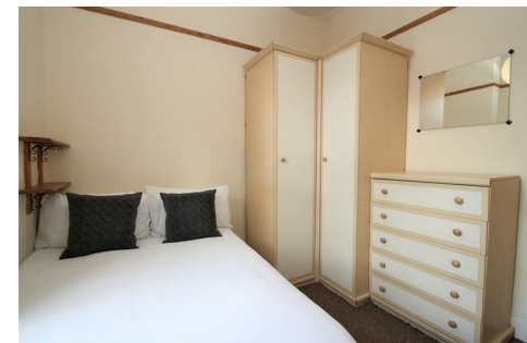
33 Shortridge Terrace, Newcastle Upon Tyne, NE2 2JE Upper Tynside Flat Floor Plan March 2025